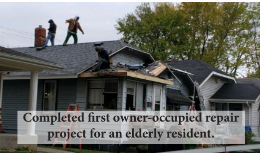
Completed first owner-occupied repair project for an elderly resident.