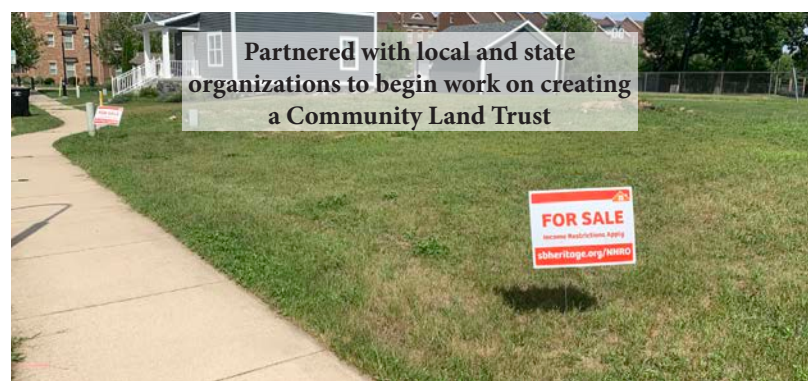
Partnered with local and state organizations to begin work on creating a Community Land Trust