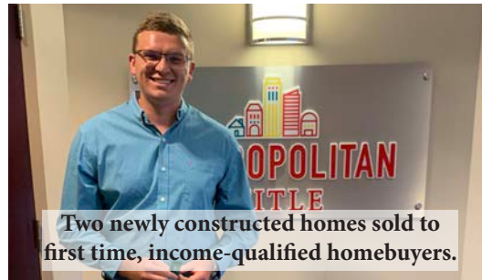
Two newly constructed homes sold to first time, income-qualified homebuyers.