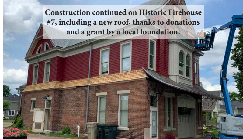
Construction continued on Historic Firehouse #7, including a new roof, thanks to donations and a grant by a local foundation.