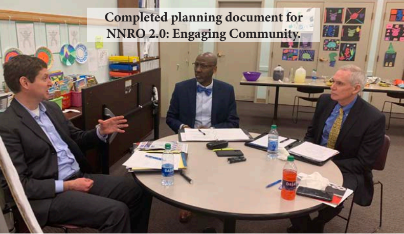
Completed planning document for NNRO 2.0: Engaging Community.