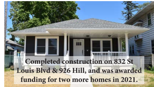
Completed construction on 832 St Louis Blvd & 926 Hill, and was awarded funding for two more homes in 2021.