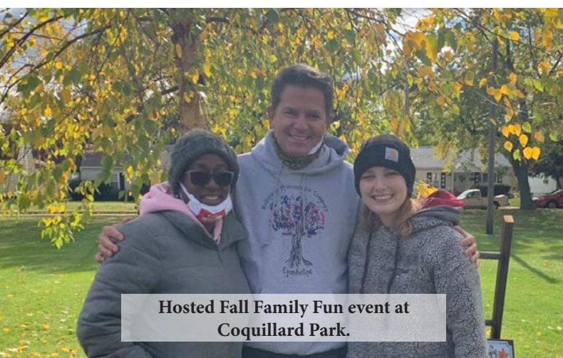
Hosted Fall Family Fun event at Coquillard Park.

To facilitate the revitalization efforts and continue to foster diversity within the Northeast Neighborhood - its residents, businesses and stakeholders - into a safe, vital, cohesive community that preserves its assets and respects the needs of all who reside, work and visit within its boundaries.