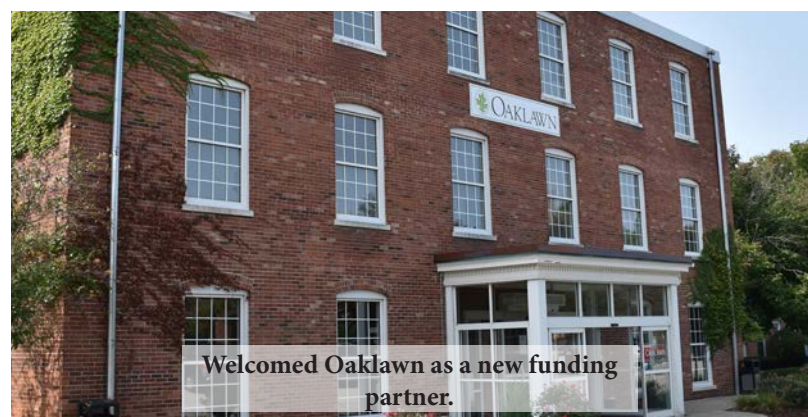
Welcomed Oaklawn as a new funding partner.