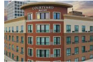
Courtyard South Bend Downtown

121 Dr. Martin Luther King Jr. Dr. South Bend, IN 46601