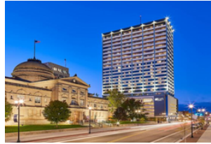
Aloft South Bend

123 N. Dr. Martin Luther King Jr. Dr. South Bend, IN 46601