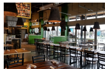
Howard Park Public House

602 E Jefferson Blvd, South Bend, IN 46617