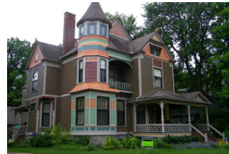
Innisfree Bed & Breakfast

630 W Washington St, South Bend, IN 46601