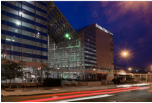
Double Tree by Hilton

123 N. Dr. Martin Luther King Jr. Dr. South Bend, IN 46601