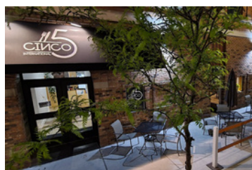
Cinco 5 International