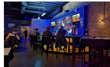
Woochi Japanese Fusion & Bar

504 E Lasalle Ave Suite 2, South Bend, IN 46617