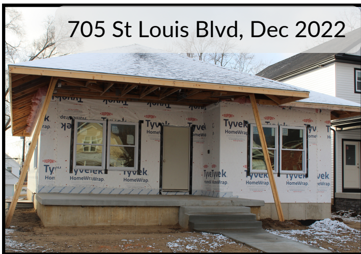
705 St Louis Blvd, Dec 2022