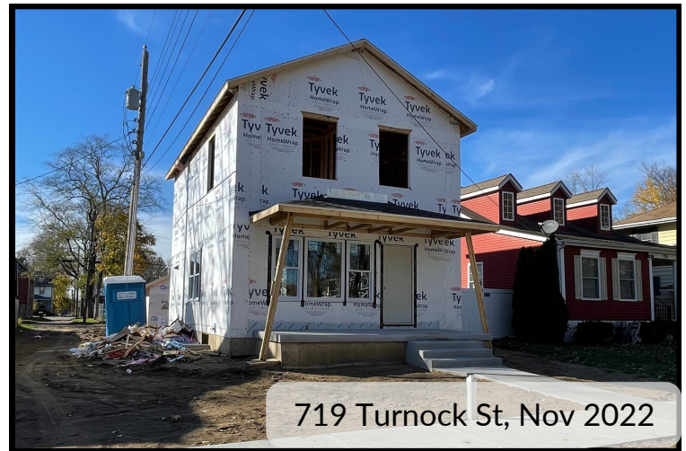
719 Turnock St, Nov 2022

In a Community Land Trust (CLT) the land is owned separately for community benefit by the NNRO. Ownership of the land serves the community by ensuring that housing will remain permanently affordable through a ground lease with the homebuyer. The CLT supports economic diversity, promotes community involvement, and combats escalating housing prices and ensures that housing remains affordable for low to moderate income households.